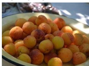
Alysh Dan: a mountain apricot community