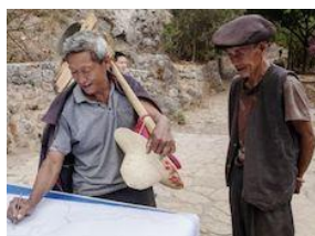
Mountain communities call for climate action