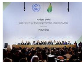
How NGOs can apply for UNFCCC observer status

The Farmer Cooperative 'Alysh Dan' was established in 2008 and is currently comprised of 1 200 members, including 63 households of bio-farmers. The cooperative produces organic products for domestic and export markets. Alysh Dan is located in the mountain village Kara-Bak, in the Batken region in southern Kyrgyzstan. Batken province is commonly known as "the