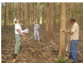
Increasing mountain forest cover in Costa Rica